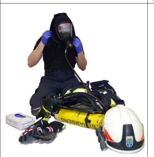
Put forward your fire protection hood.