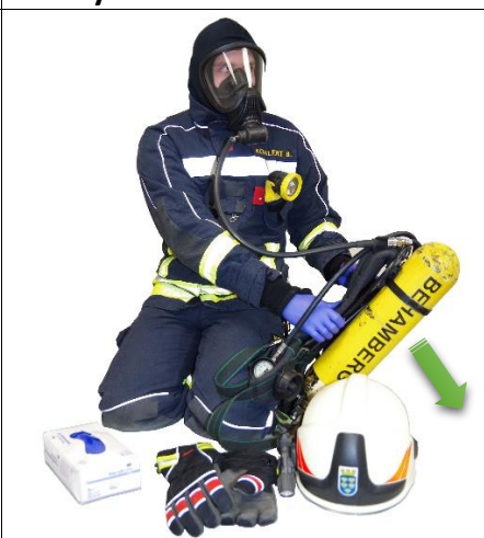
Put the SCBA on the ground.