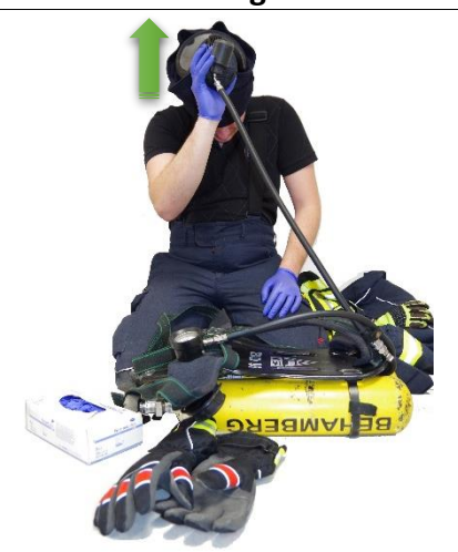
Grab your mask at the front and pull it off.