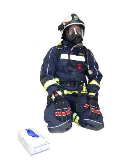
Find a smoke-free spot. Get on your knees.