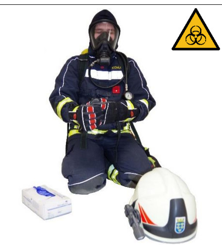
Remove gloves. Do not touch the equipment with your bare hands.