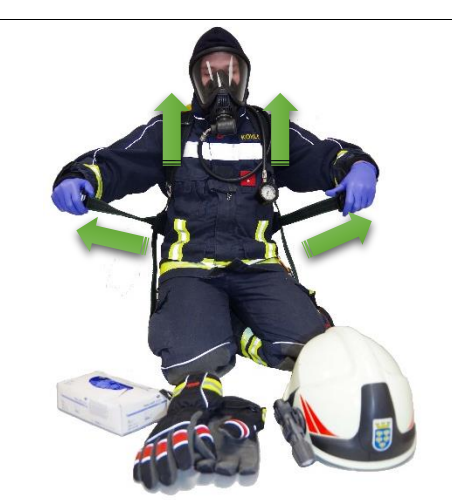
Open the SCBA harness completely.