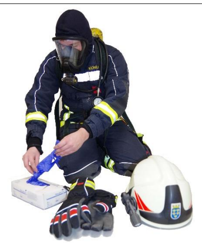
Use disposable gloves.