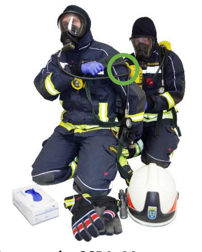
Remove the SCBA. May someone supports you... Pay attention to the regulator.