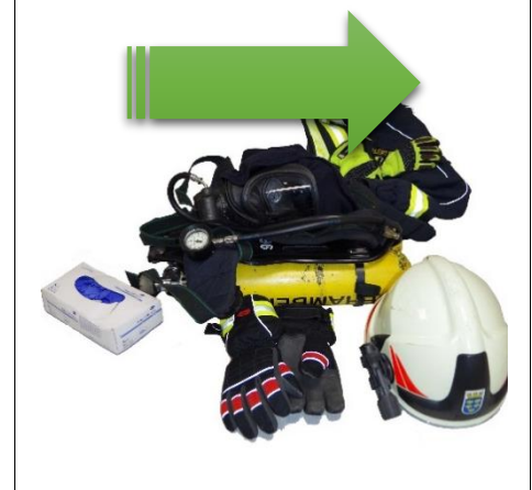
Now get away from the contaminated equipment.