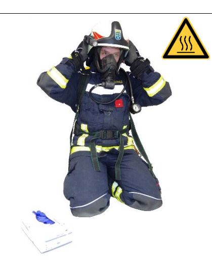
Remove Helmet (5-Point Mask). Caution! Parts of the equipment may still be hot!