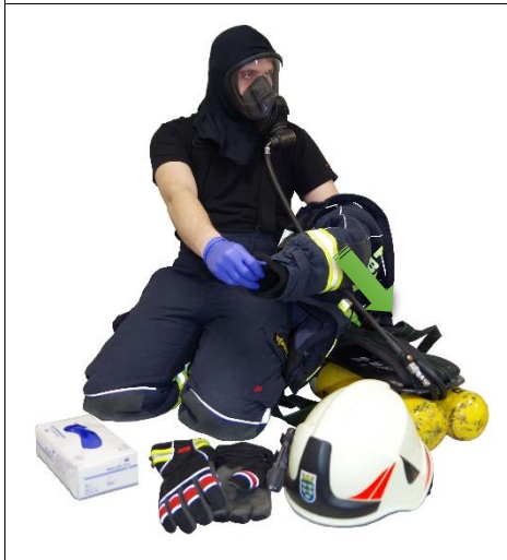
Remove your jacket.